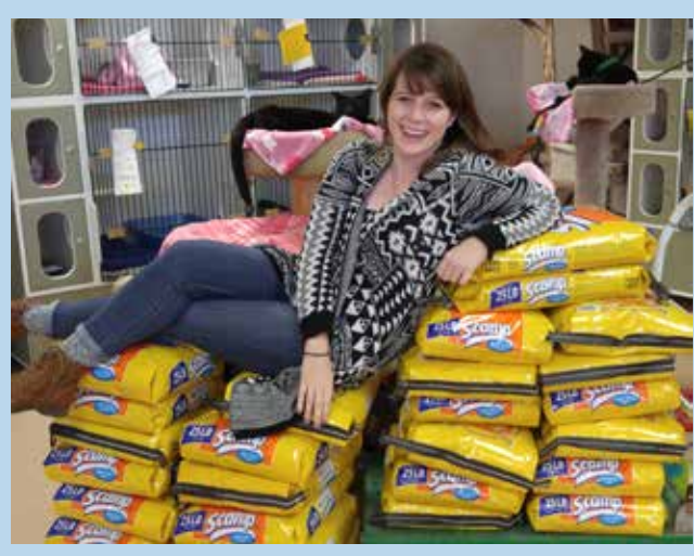
Did you know that, on average, Cat Welfare uses twenty-seven 25-pound bags of litter each day?