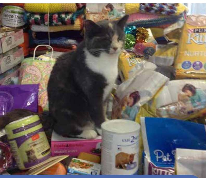
Thanks to everyone who donated supplies during our kitten shower! Our littlest residents appreciate your generosity.